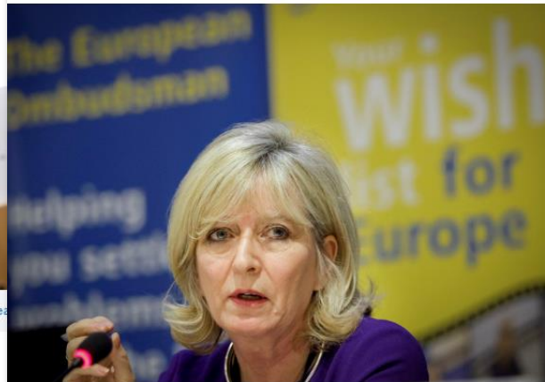
Secret EU lawmaking could be put in the spotlight by the ombudsman

(pictured) has opened an investigation into the transparency of secret law-making in the EU. Trilogues are informal negotiations between the Council and the Commission aimed at reaching early agreements