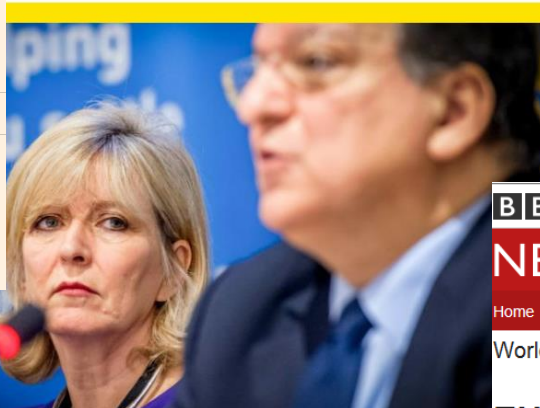
Emily O'Reilly, EU Ombudsman, with EU Commission president 2009-2014, José Manuel Barroso.

Ombudsman voices concern over Goldman job